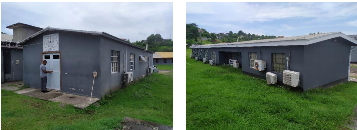
Figure 1.2. Example of the Police Training School barracks