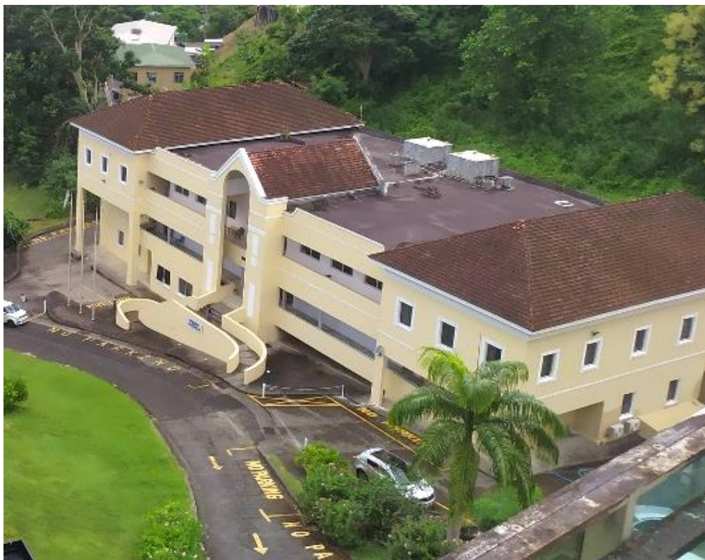
Figure 1.2 Front of the Ministry of Education building